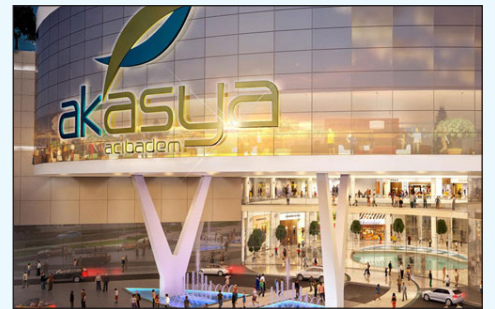
Project: Akasya Mall Ümraniye Raw Water Source: City Water System: Filtration, Softening, Dosing