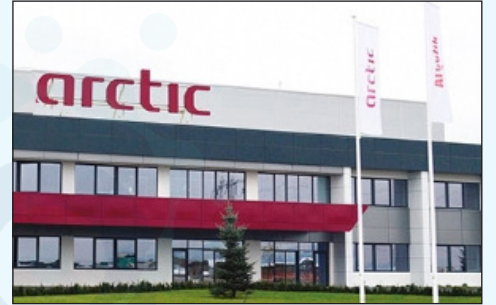
Project: Arctic SA Romania Factory Raw Water Source: Waste Water System: MBR, RO