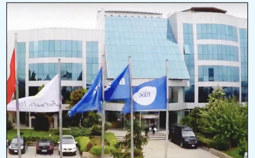
Project: Boybo Textile Raw Water Source: City Water System: RO