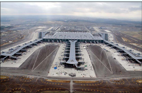
Project: İstanbul New Airport DHL Building Raw Water Source: Gray Water, City Water System: MBR, Filtration, Softening, Disinfection, Dosing