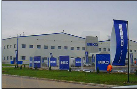
Project: Beko Moscow Factory Raw Water Source: Process Water System: Filtration, RO, Dosing