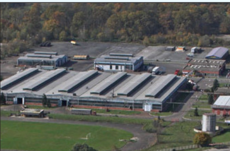
Project: Kraljevo Textile Factory Raw Water Source: City Water System: Filtration