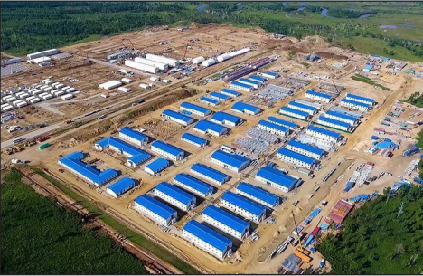
Project: Gazprom Amur Doğal Gaz İşletim Tesisi Kampı Raw Water Source: City, Waste Water System: MBR, UF, RO