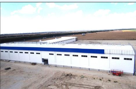
Project: Yaris Kabin Factory Hungary Raw Water Source: Chemical Waste Water System: Waste Water Treatment, RO