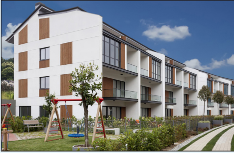
Project: Emlak Konut Köy Project Raw Water Source: City Water System: Filtration, Softening, Disinfection, Dosing