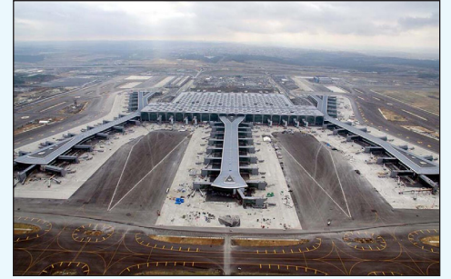
Project: İstanbul New Airport Raw Water Source: Gray Water System: MBR