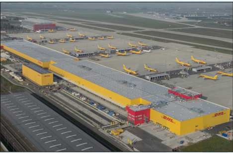
Project: İstanbul New Airport DHL Building Raw Water Source: City Water System: Filtration, Dosing, RO