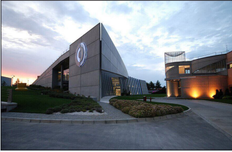
Project: Abdi İbrahim Esenyurt Factory Raw Water Source: Waste Water System: MBR