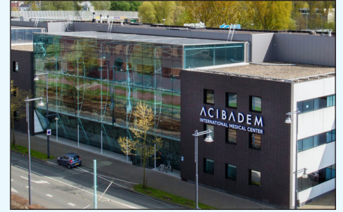
Project: Acibadem Int. Amsterdam Medical Center Raw Water Resource: City Water System: Filtration, Softening, Dosing, RO