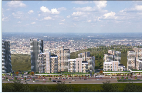
Project: Emlak Konutları Başkent Buildings Raw Water Source: City Water System: Filtration, Softening, Dosing