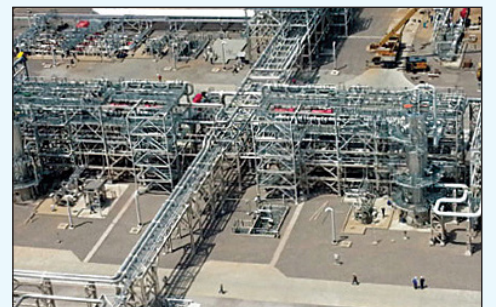
Project: Turkmenistan Worker Camp Projects Raw Water Source: Waste Water, Sea Water System: MBR, RO, Filtration, Dosing