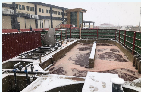
Project: Karapınar Slaughterhouse Raw Water Source: Waste Water System: Waste Water Treatment