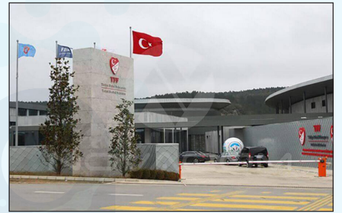
Project: TFF Riva Facilities Raw Water Source: Gray Water System: MBR