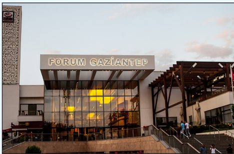
Project: Gaziantep Forum Mall Raw Water Source: City Water System: Filtration, Dosing