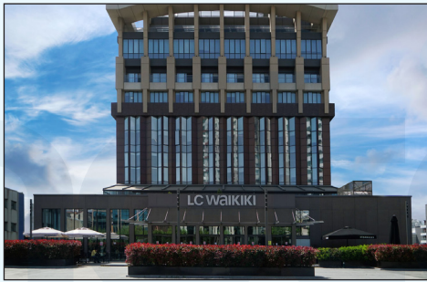
Project: LCW Tekstilcent Building Raw Water Source: Gray Water System: Filtration, Softening, Disinfection, Dosing