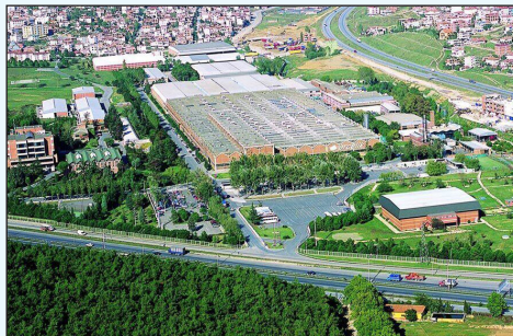
Project: Arçelik Çayırova Factory Raw Water Source: Waste Water System: UF, RO