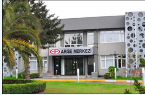
Project: Erdemir Ereğli RD Center Raw Water Source: Process Water System: Filtration