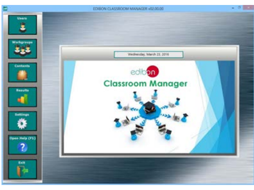
ECM-SOF. EDIBON Classroom Manager (Instructor Software) Application Main Screen

ETTE. EDIBON Training Test & Exam Program Package - Main Screen with Numeric Result Question