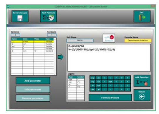
ECAL. EDIBON Calculations Program Package - Formula Editor Screen