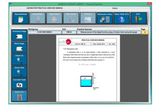
EPE. EDIBON Practical Exercise Program Package Main Screen