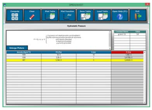
ECAL. EDIBON Calculations Program Package Main Screen

* Specifications subject to change without previous notice, due to the convenience of improvement of the product.