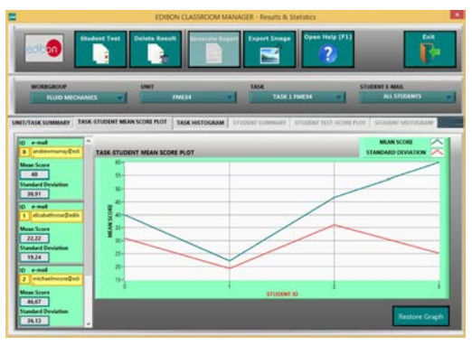
ERS. EDIBON Results & Statistics Program Package - Student Scores Histogram