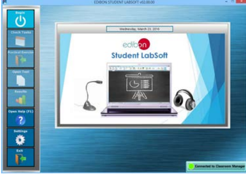
ESL-SOF. EDIBON Student LabSoft (Student Software) Application Main Screen