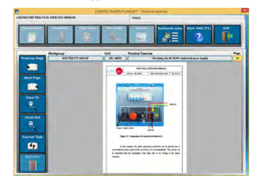
EPE. EDIBON Practical Exercise Program Package Main Screen