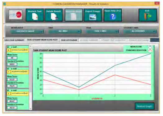
ERS. EDIBON Results & Statistics Program Package - Student Scores Histogram