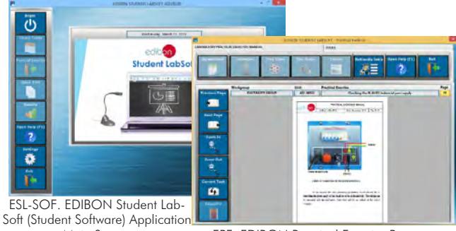
Main Screen EPE. EDIBON Practical Exercise Program Package Main Screen