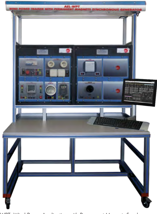
① Unit: AEL-WPT. Wind Power Application with Permanent Magnets Synchronous Generator

Engineering and Technical Teaching Equipment