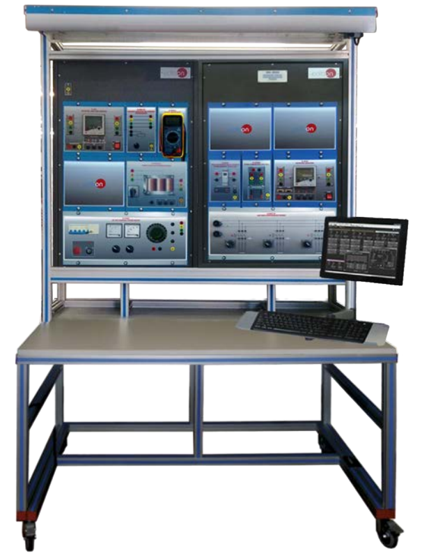
O Unit: AEL-VTFP. Voltage Transformer Fundaments for Protection Devices