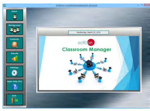
ECM-SOF. EDIBON Classroom Manager (Instructor Software) Application Main Screen