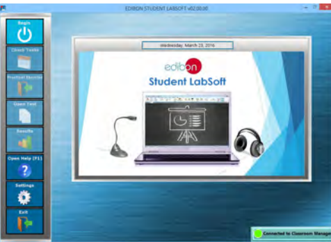
ESL-SOF. EDIBON Student LabSoft (Student Software) Application Main Screen

ERS. EDIBON Results & Statistics Program Package - Question Explanation