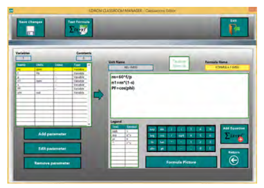
ECAL. EDIBON Calculations Program Package - Formula Editor Screen