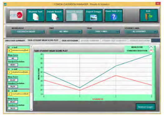
ERS. EDIBON Results & Statistics Program Package - Student Scores Histogram