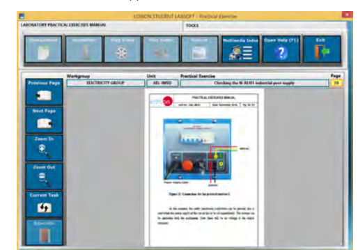
EPE. EDIBON Practical Exercise Program Package Main Screen