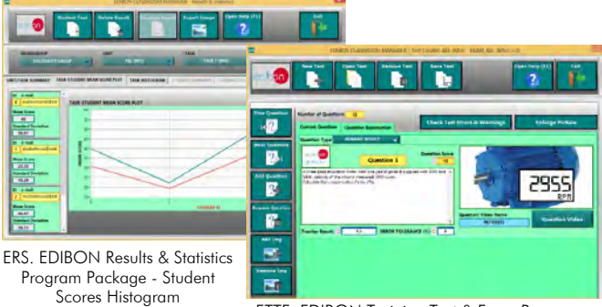
ETTE. EDIBON Training Test & Exam Program Package - Main Screen with Numeric Result Question