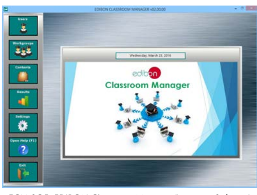
ECM-SOF. EDIBON Classroom Manager (Instructor Software) Application Main Screen