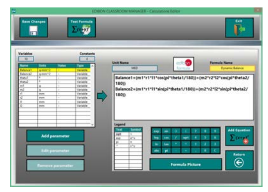
ECAL. EDIBON Calculations Program Package - Formula Editor Screen