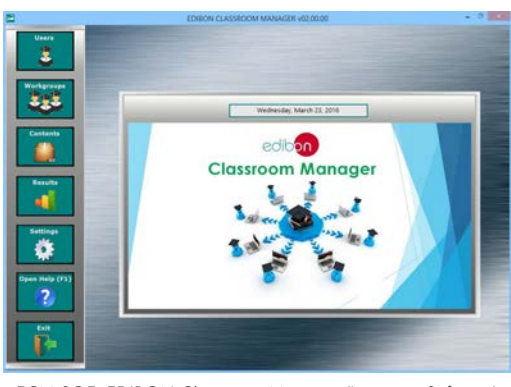
ECM-SOF. EDIBON Classroom Manager (Instructor Software) Application Main Screen