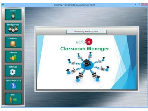
ECM-SOF. EDIBON Classroom Manager (Instructor Software) Application Main Screen

ETTE. EDIBON Training Test & Exam Program Package - Main Screen with Numeric Result Question