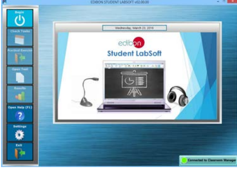
ESL-SOF. EDIBON Student LabSoft (Student Software) Application Main Screen