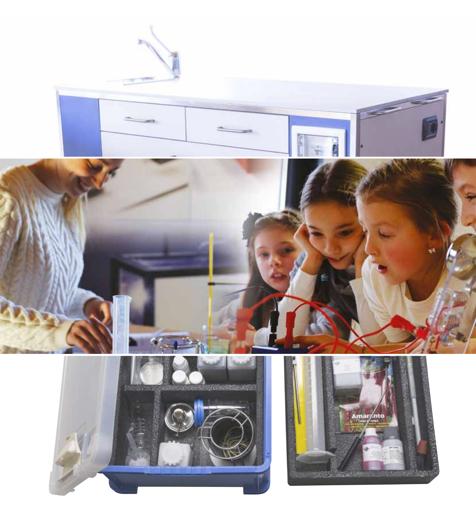
KITS - MOBILE LAB