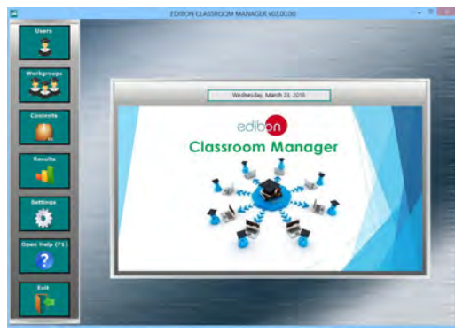
ECM-SOF. EDIBON Classroom Manager (Instructor Software) Application Main Screen