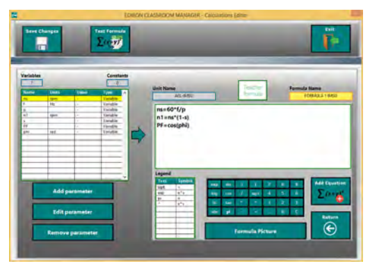
ECAL. EDIBON Calculations Program Package - Formula Editor Screen