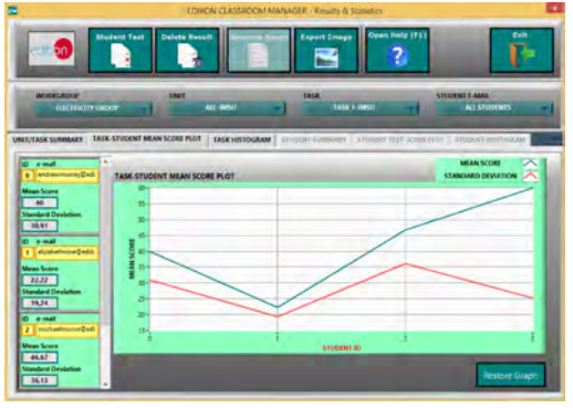
ERS. EDIBON Results & Statistics Program Package - Student Scores Histogram